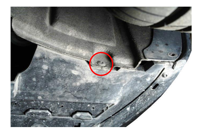
5. On both sides remove 1 pc Torx T25 in the front lower end in each wheel arch.

6. In the lower edge of the bumper remove 3pcs plastic rivets. Press both the plastic tabs towards the middle and then gently pull it out in its collar.